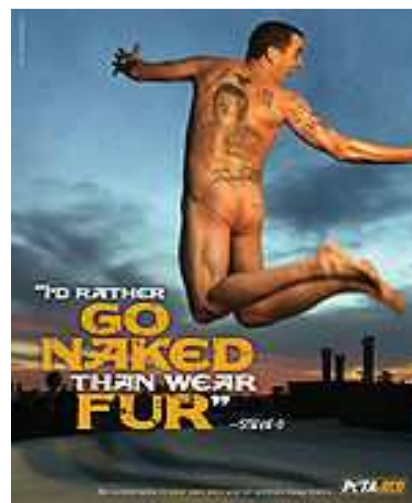
Steve-O during PETA's "I'd rather go naked than wear fur" campaign

The New Yorker writes that PETA activists have crawled through the streets of Paris wearing leg-hold traps and thrown around money soaked in fake blood at the International Fur Fair. They regularly engage in pie-throwing—in January 2010, Canadian MP Gerry Byrne compared them to terrorists for throwing a tofu cream pie at Canada's fishery minister Gail Shea in protest at the seal hunt.